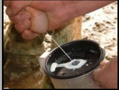
Using the black cup, squirt milk from each quarter in order to see wich one is infected.