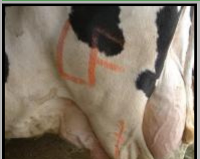
Observe cows for markings.