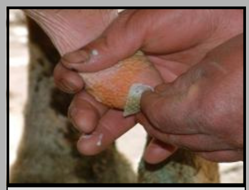
Apply teat dip and clean the entire teat with a paper towel. using an alchool pad, scrub the teat end.