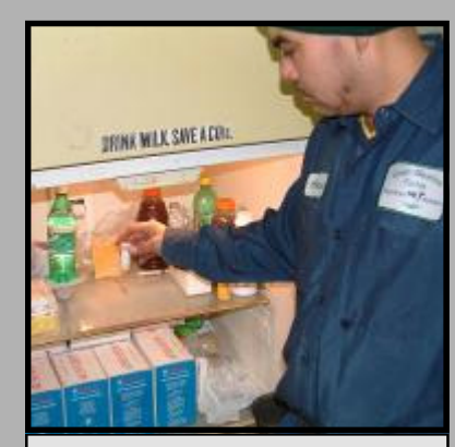
Place sample bottle in refrigerator. Take the sample in the same day to farm 3 refrigerator (veterinary room).