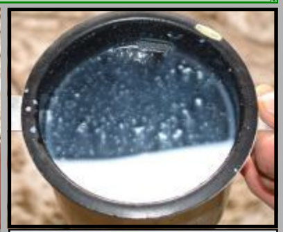
Check the milk in the black cup for each teat, if the milk is not normal a sample from that quarter is needed ( if more than one quarter is infected, different samples should be taken in different vials).